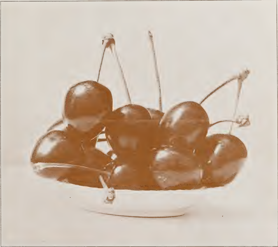
A little over one-half natural size.

The earliest of all large cherries. The largest of all early cherries, and not only the best of all early cherries, but unsurpassed by any cherry of any season.